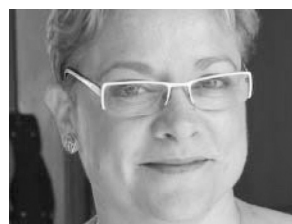
Melissa Mercadal-Brotons Publications