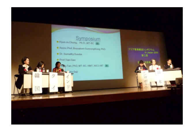
Figure 3. Symposium with representative panelists