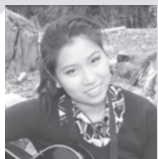
Vienna Sa North America

Since the WFMT ASD was established in 2009, student delegates from eight regions of the world have been working to support music therapy students on the globe - the WFMT's eight regions include: Africa, Australia/New Zealand, Eastern Mediterranean, Europe, Latin America, North America, Southeast Asia, and Western Pacific. The aims of the ASD are to enhance students' knowledge of the profession, to provide a forum for international student activities, to facilitate the sharing of ideas, thoughts, and opinions, and to assist in preparing responsible, politically aware, and skillful leadership of WFMT. website: http://www.wfmt.info/wfmt-for-students-2014-2017/